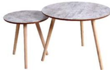
Coffee Table Sap Code: 402-201-10 W60 x D60 x H46.5 cm Density board + solid wood 81 USD