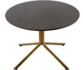
Coffee Table Sap Code: 402-201-65 W60 x H41 cm Black Sintered stone+stainless steel frame 382 USD