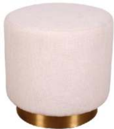
Stool Sap Code: 402-105-11 Ø475*480mm (W*D*H) CLOTH CUSHION + STAINLESS STEEL LEG 189 USD