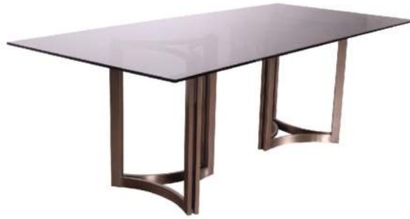
Dining Table Sap Code: 401-201-48 2200x1000x755 mm (W*D*H) TOP:12mm gray glass tempered/ LEG: black nickel brushed stainless steel 1,523 USD