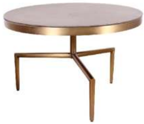
Coffee Table Sap Code: 402-201-83 Ø 600*400 mm Top: Wood+Glass/Leg: Iron 368 USD