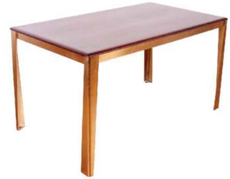
Dining Table Sap Code: 401-201-35 1400*800*760mm (W*D*H) TOP:WALNUT VENEER /METAL LEG 1,092 USD