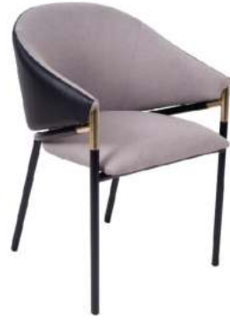
Dining Chair Sap Code: 401-301-28 W58 x D56 x H78 cm BACK-PU / FRONT-FABRIC / BASE - IRON 139 USD