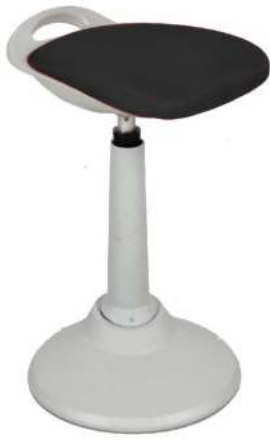
Bar Chair Sap Code:305-101-06 W40 x D41 x H65 cm Black cloth seat. Automatic return to the gas pole. Gray plastic board