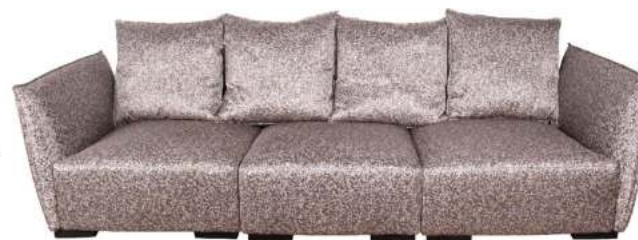
3 Seater Sofa (With 4 Pillow) Sap Code: 402-102-102 2710*1050*740 mm Fabric , Wooden feet with black walnut veneer natural paint 2,310 USD