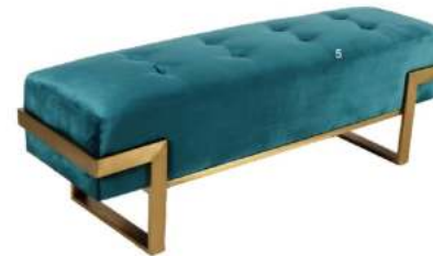
Stool Sap Code: 401-101-37 W140 x D140 x H45 Fabric: Velvet B.Green Leg Gold 520 USD