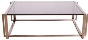
Coffee Table Sap Code: 402-201-84 1200*750*380 mm (W*D*H) Top: Tempered Glass Leg : Stainless Steel 473 USD