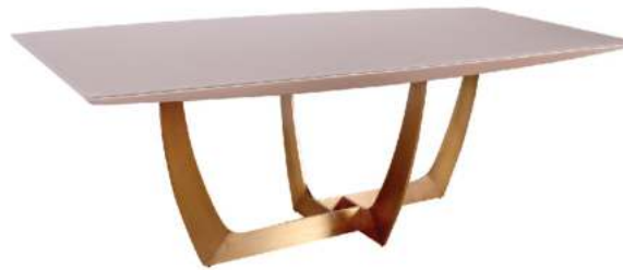
Dining Table Sap Code: 401-201-58 2400*1000*760 mm (W*D*H) TOP:GLASS+MDF / METAL LEG 2,310 USD