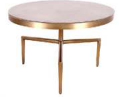
Coffee Table Sap Code: 402-201-82 Ø700*400 mm OP:WOOD+GLASS/IRON LEG 410 USD