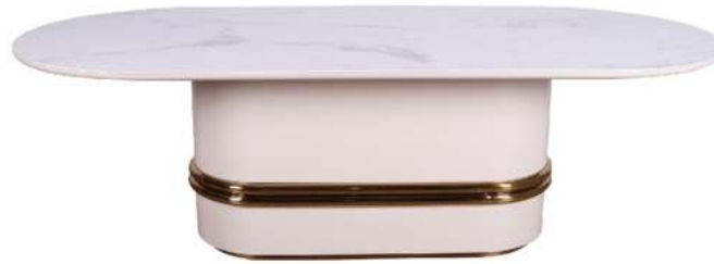
Dining Table Sap Code: 401-201-36 2200*980*760 mm (W*D*H) TOP:MDF+CERAMIC /METAL LEG 3,129 USD