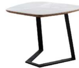
Coffee Table Sap Code: 402-201-69 W50 x D50 x H43 cm Gray Sintered stone+steel frame 393 USD