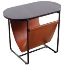
Coffee Table Sap Code: 402-201-67 W65 x D35 x H50 cm Black Sintered stone+steel frame 449 USD