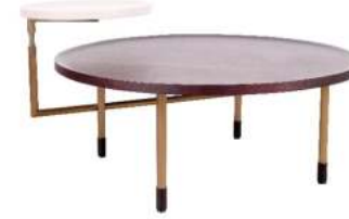
Coffee Table Sap Code: 402-201-88 WØ 900* 465 mm Top: MDF/Leg: Stainless Steel 683 USD