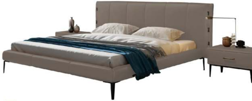
3 Bed Frame Sap Code: 403-201-17 W 225 x D 220 x H 106 cm Mattress : W 183 x L198 PU Leather 1,329 USD