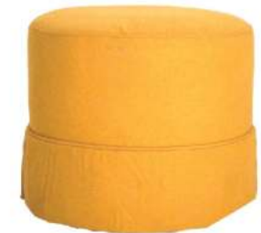
Stool Sap Code: 304-501-03 W53 x H31 Fabric 93 USD