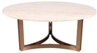
Coffee Table Sap Code: 402-201-58 W90 x D90 x H35 cm Marble/Base:Stainless steel, Yellow/cooper 924 USD