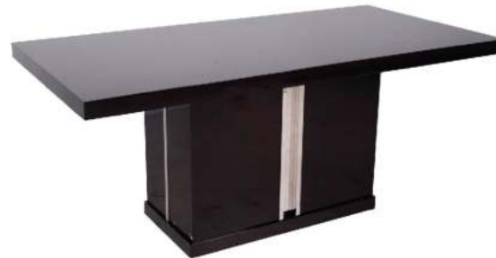
Dining Table Sap Code: 401-201-31 1800 x 900 x 760 mm(W*D*H) TOP & BASE :MDF +VENNER+STAINLESS STEEL 924 USD