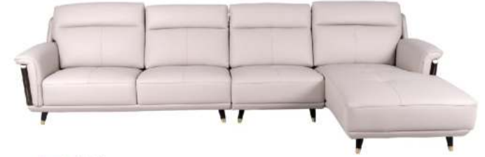
Sofa Sap Code: 402-103-16 W 349 x D 170 x H 92 cm LEATHER / SOLID RUBBER ARM 2,310 USD