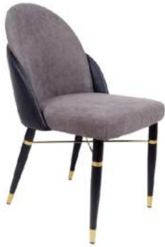
Dining Chair Sap Code: 401-301-32 W52 x D60 x H83 cm OuterBack Black PU+Fabric Grey Inner Back&Seat, Iron Matt Black Legs With Champagne Gold 162 USD