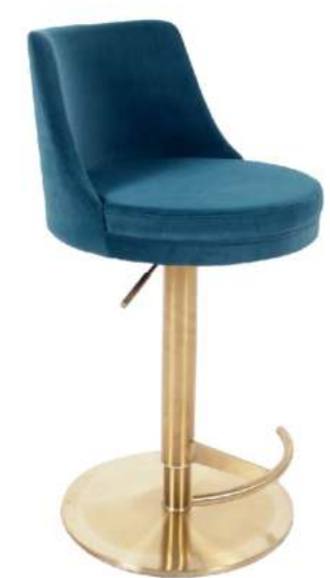
Bar Chair Sap Code: 305-201-06 W44 x D52x H80-105cm Brushed stainless steel, the seat upholstered with normal