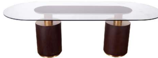
Dining Table Sap Code: 401-201-55 2400x1000x740 mm (W*D*H) TOP:GLASS+CERAMIC SHEET /STAINLESS STEEL LEG 1,365 USD