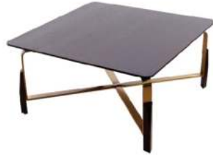
Coffee Table Sap Code: 402-201-61 W85 x D85 x H40 cm Venner+Brushed Titanium+Solid Wood Feet 578 USD