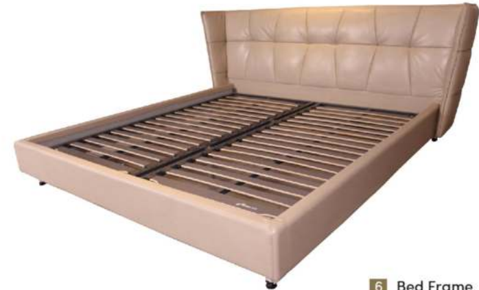
6 Bed Frame Sap Code: 403-201-02 180*200 cm Italy Leather-imitation Fabric 1,502 USD