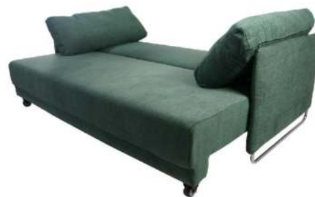
3s Sofa Bed Sap Code: 402-104-03 W200 x D98 x H81 cm Fabric: Green 809 USD