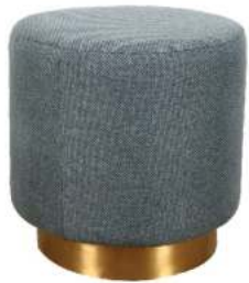
Stool Sap Code: 402-105-09 Ø475*480mm (W*D*H) CLOTH CUSHION + STAINLESS STEEL LEG 189 USD