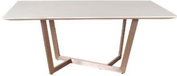
Dining Table Sap Code: 401-201-39 1600*800*760 mm (W*D*H) TOP:MDF /METAL LEG 945 USD