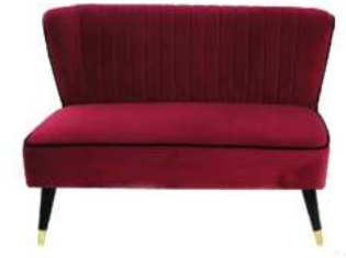
Stool Sap Code: 401-101-36 W26 x D68 x H80 Fabric: Velvet Red+Black hem Leg Black+Gold 468 USD