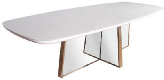
Dining Table Sap Code: 401-201-59 2800x1100x760 mm (W*D*H) TOP:GLASS+MDF / STAINLESS STEEL LEG+GLASS 2,940 USD