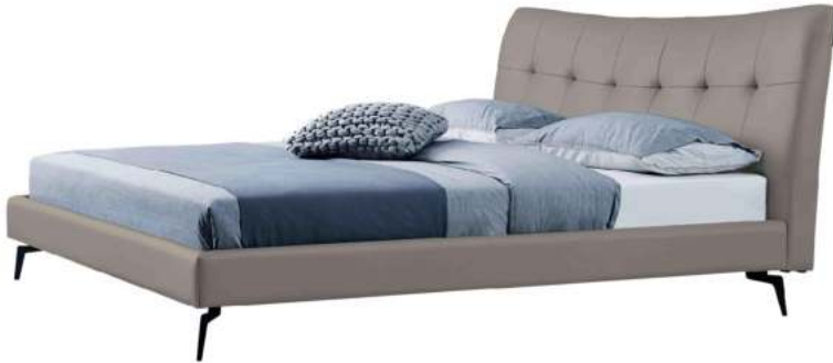
4 Bed Frame Sap Code: 403-201-18 W 228 x D 201 x H 104 cm Mattress : W 183 x L 198 PU Leather 1,329 USD