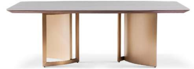
Dining Table Sap Code: 401-201-13 2200x980x760mm (W*D*H) 5mm white marble, bass walnut veneer lacquered, brass with stainless steel. 2,195 USD