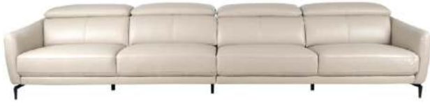
L Shape Sofa Sap Code: 402-102-15 W 283 x D 174 x H 75 cm Laf Sofa PU Leather/Black Aluminium Alloy Powder Coating Leg, Taupe 2,871 USD