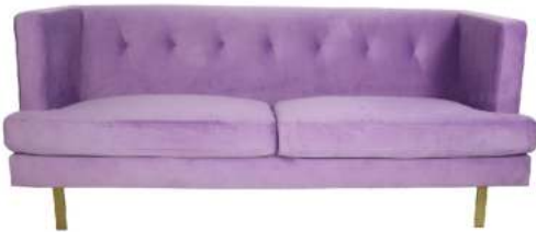
3 Seater Sofa Sap Code: 402-101-28 W207 x D86 x H84 cm Fabric, Velvet Purple, Leg, Golden 867 USD