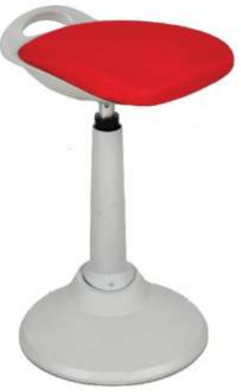
Bar Chair Sap Code:305-101-07 W40 x D41 x H65 cm Red cloth seat. Automatic return to the gas pole. Gray plastic board