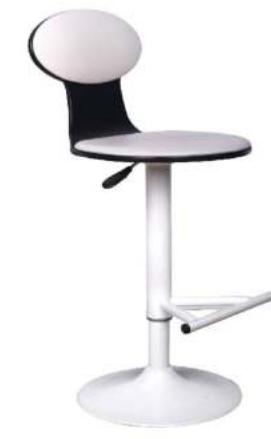
Bar Chair Sap Code:305-201-01 W46 x D42 x H35 Metal & Sofa,Black & Red