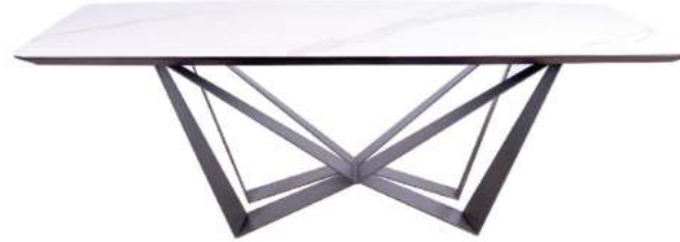
Dining Table Sap Code: 401-201-54 2200*980*760mm (W*D*H) TOP: horse-bellied Sahara gold ceramic sheet with MDF black matt paint/ LEG: and steel with dark gray matt paint. 2,310 USD