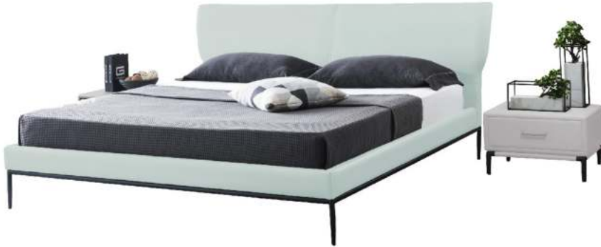
6 Bed Frame Sap Code: 403-201-20 W 223 x D 212 x H 96 cm Mattress : W 183 x L198 Fabric 1,502 USD