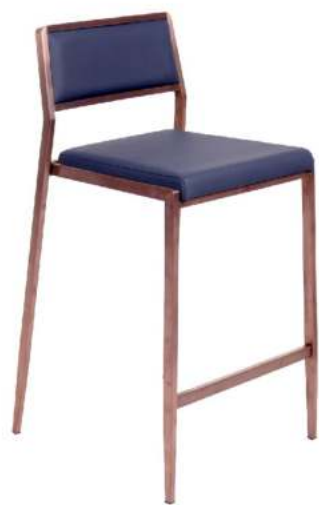
Bar Chair Sap Code: 305-101-12 W47 x D51 x H90-66 cm Brushed stainless steel, FOAM + PU the seat upholstered with normal