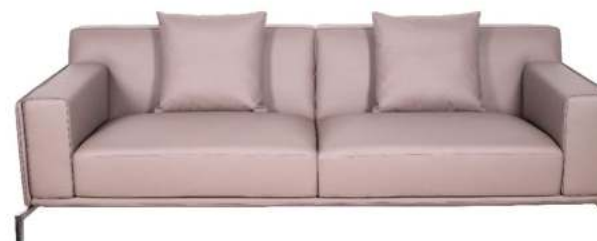
Sofa Set Sap Code: 402-102-18 2330*930*740 mm / 1730*930*740 mm / 1100*930*740 mm Leather/Aluminium Alloy Feet 2,625 USD