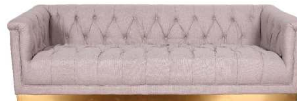
Sofa Set Sap Code: 402-101-97 890*890*680H/1650*890*680H 2410*890*680H mm Velvet Fabric,Stainless Steel Leg 2,888 USD