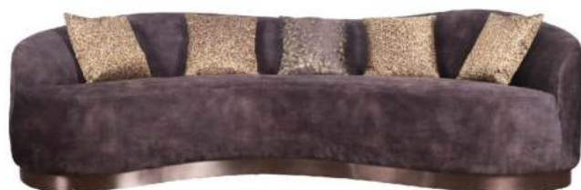
3 Seater Sofa (With 5 Pillows) Sap Code: 402-102-100 2640*1050*790mm (W*D*H) Fabric , The tripod -brushed metal with brass color. 1,890 USD