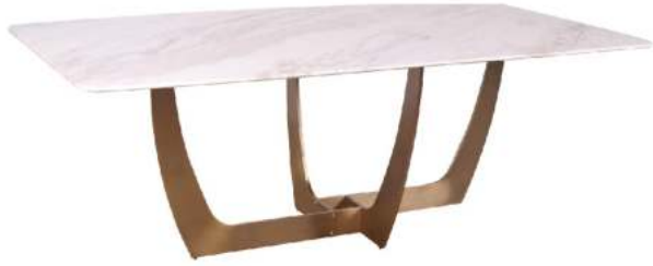
Dining Table Sap Code: 401-201-52 2200*1000*760 mm (W*D*H) TOP: natural jazz white marble/ LEG: steel with brushed bronze brushed. 3,045 USD