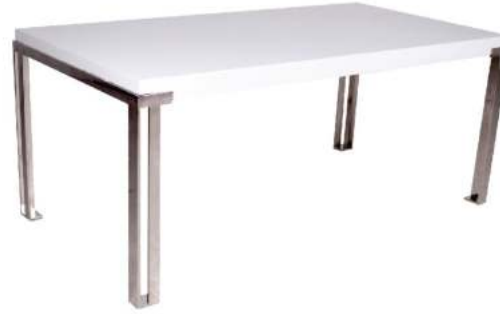
Dining Table Sap Code: 401-201-29 1810 x 910 x 760 mm (W*D*H) TOP:MDF \ BASE:STAINLESS STEEL 901 USD