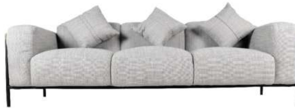
3 Seater Sofa Sap Code: 402-101-77 W 234 x D 98 x H 76 cm Fabric/ Stainless Steel Leg, Grey, Leg Color: Black 1,623 USD