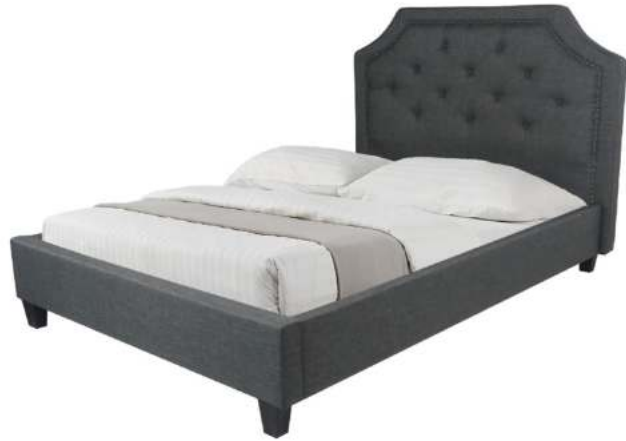
1 Bed Frame Sap Code: 403-201-06 W 122 x D 222 x H 130 cm Mattress : W 107 x L 200 cm Fabric : Dark Gray 359 USD