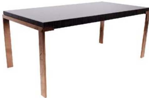
Dining Table Sap Code: 401-201-30 1810 x 910 x 760 mm(W*D*H) TOP:MDF \ BASE:STAINLESS STEEL 1,155 USD