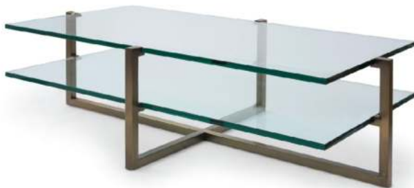
Coffee Table Sap Code: 402-201-42 W140 x D80 x H40 cm 19mm clear glass,untempered, metal leg in red copper painting 924 USD