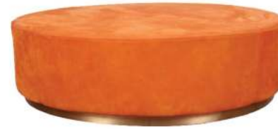
Stool Sap Code: 402-105-12 Ø1000*283mm (W*D*H) IMITATION LEATHER + LEATHER UPHOLSTERY / METAL LEG 578 USD