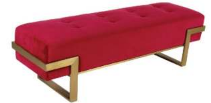
Stool Sap Code: 401-101-38 W140 x D140 x H45 Fabric: Velvet B.Red Leg Gold 520 USD