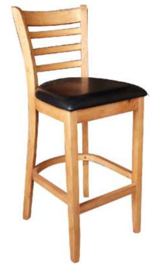
Bar Chair Sap Code: 304-201-02 W86 x D46 x H47 cm Oak + cushion cortex