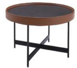
Coffee Table Sap Code: 402-201-47 W60 x H40 cm MDF top with walnut veneer, side with frame powder coated in matt, dark brown+black colour 336 USD