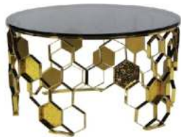
Coffee Table Sap Code: 402-201-18 W80 x H45 cm stainless steel electroplated titanium + gold foil + gray glass 1,008 USD