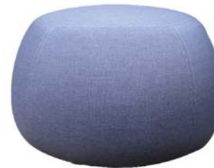
Stool Sap Code: 304-501-02 W65 x H43 Fabric 301 USD