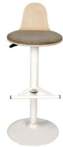
Bar Chair Sap Code : 305-201-02 46*42*35 cm Metal & Sofa