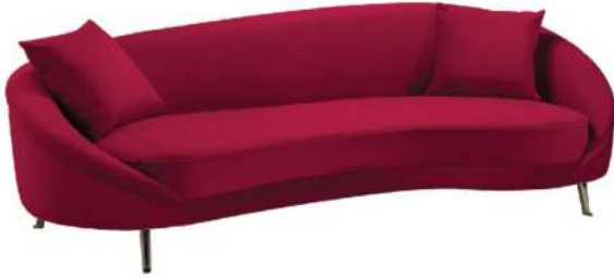
3 Seater Sofa Sap Code: 402-101-64 W 247 x D 105 x H 81 cm Fabric, Velvet D.Red, Leg, Golden 1,098 USD