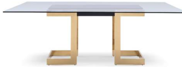
Dining Table Sap Code: 401-201-10 2200x1000x765mm (W*D*H) TOP:12mm tempered clear glass top, MDF in matt black, stainless steel in gold finish 1,179 USD