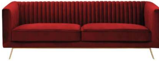
3 Seater Sofa Sap Code: 402-101-56 W 209 x D88 x H70 cm Fabric, Velvet D.Red, Leg, Golden 867 USD