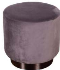
Stool Sap Code: 402-105-20 Ø475*480mm (W*D*H) CLOTH CUSHION + STAINLESS STEEL LEG 189 USD