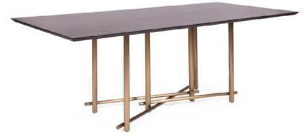
Dining Table Sap Code: 401-201-12 W220 x D100 x H75 cm 25mm MDF veneer lacquered top, base frame with stainless steel brushed in brass plating. 1,288 USD