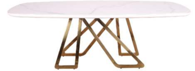
Dining Table Sap Code: 401-201-53 2200*980*760 mm (W*D*H) TOP: 5mm snowflake white ceramic plate with MDF white matte / LEG: stainless steel 2,940 USD