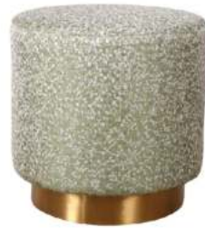
Stool Sap Code: 402-105-10 Ø475*480mm (W*D*H) CLOTH CUSHION + STAINLESS STEEL LEG 189 USD