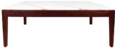
Coffee Table Sap Code: 402-201-74 W100 x D100 x H42 cm TOP:MARBLE \ BASE:BEECH + VENNER 982 USD