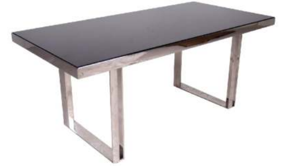
Dining Table Sap Code: 401-201-26 1800 x 900 x 760 mm (W*D*H) TOP:TEMPERED GLASS \ BASE:STAINLESS STEEL 1,063 USD