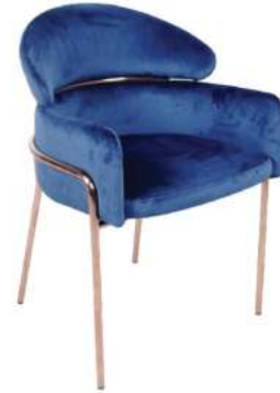
Dining Chair Sap Code: 401-301-30 W57 x D58 x H79 cm VELVET FABRIC / POLISHED STAINLESS STEEL 185 USD