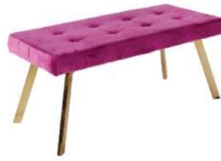
Stool Sap Code: 401-101-32 W105 x D47 x H47 Fabric: Velvet Purple, Leg: Golden 220 USD