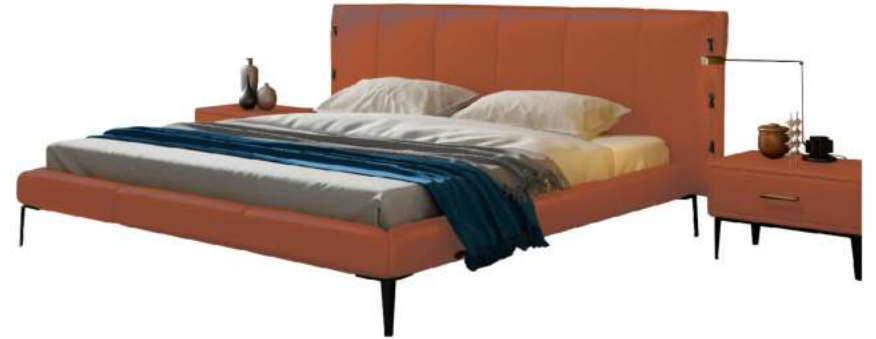
2 Bed Frame Sap Code: 403-201-16 W 225 x D 220 x H 106 cm Mattress : W 183 x L 198 PU Leather 1,329 USD