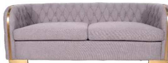
Sofa Set Sap Code: 402-101-94 980*900*710H/1760*900*710H 2280*900*710H mm Velvet Fabric,Stainless Steel Leg 3,675 USD