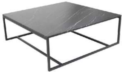
Coffee Table Sap Code: 402-201-25 W100 x D100 x H35 cm Black and white root marble + black iron frame,Black+Black 555 USD