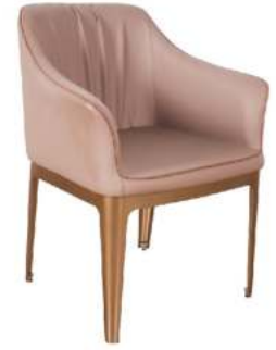
Dining Chair Set 4pcs Sap Code: 401-301-34 620*600*815 mm ECO LEATHER CUSHION +STAINLESS STEEL LEG 1,470 USD