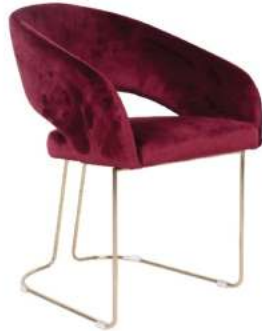
Dining Chair Sap Code: 401-301-31 W60 x D55 x H76 cm VELVET FABRIC / POLISHED STAINLESS STEEL 185 USD