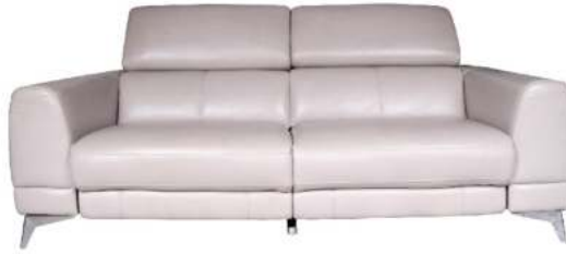
2.5 Seater Sofa Sap Code: 402-103-08 W 216 x D 104 x H 76 cm RUBBER WEBBING + NO-SAG SPRING 2,449 USD