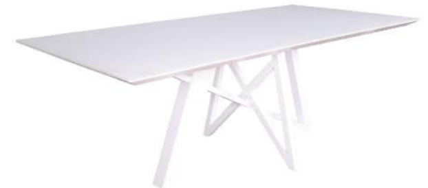
Dining Table Sap Code: 401-201-44 2200x1000x760 mm (W*D*H) TOP:MARBLE+MDF / METAL LEG 998 USD