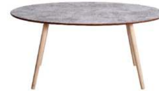
Coffee Table Sap Code: 402-201-07 W100 x D60 x H46.5 cm Density board + solid wood 116 USD