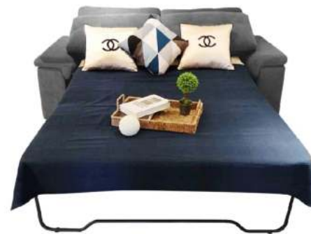
Sleeper Sofa Bed Sap Code: 402-104-01 W198 x D88 x H85 cm Upholstery: Charcoal 752 USD