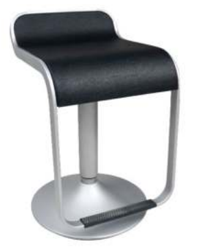
Bar Chair Sap Code: 305-201-04 W35.5 x D44x H51cm PU imitation leather, iron spray paint, can be turned up and down,Black