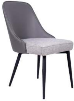
Dining Chair Sap Code: 401-301-25 W48 x D58 x H82 cm BACK-PU / SEAT- FABRIC / IRON LEG 123 USD