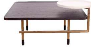
Coffee Table Sap Code: 402-201-89 850*850*465 mm (W*D*H) Top : MDF Leg : Stainless Steel 630 USD