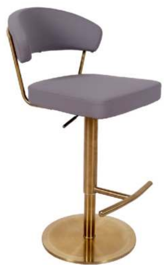
Bar Chair Sap Code: 305-201-05 W44 x D52x H80-105cm Brushed stainless steel, the seat upholstered with normal