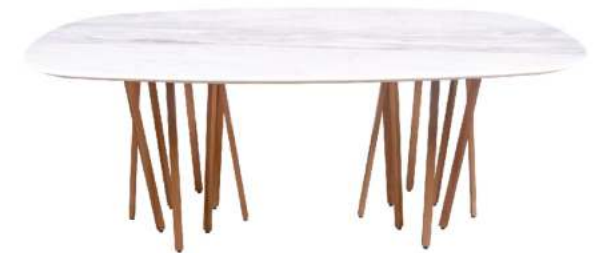
Dining Table Sap Code: 401-201-42 2000*1000*760 mm (W*D*H) TOP:MARBLE+MDF/ STAINLESS STEEL LEG 2,940 USD