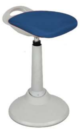
Bar Chair Sap Code:305-101-09 W40 x D41 x H65 cm Blue cloth seat. Automatic return to the gas pole. Gray plastic board