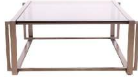
Coffee Table Sap Code: 402-201-85 900*900*380 mm (W*D*H) Top: Tempered Glass Leg : Stainless Steel 473 USD