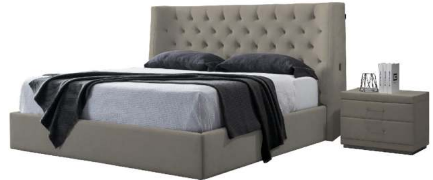
5 Bed Frame Sap Code: 403-201-19 W 226 x D 208 x H 127 cm Mattress : W 183 x L 198 Fabric 1,502 USD