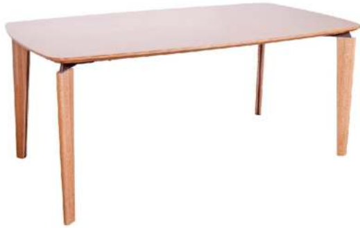
Dining Table Sap Code: 401-201-38 1600*900*755 mm (W*D*H) TOP:MDF /METAL LEG 1,890 USD