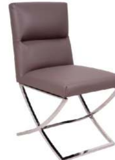
Dining Chair Sap Code: 401-301-29 W49 x D62 x H90 cm PU COVER / POLISHED STAINLESS STEEL 174 USD