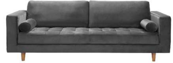
3 Seater Sofa Sap Code: 402-101-60 W 226 x D 89 x H 84 cm Fabric, Velvet D.Grey, Leg, Golden Available Colour ● 809 USD