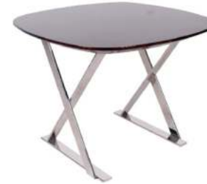
Coffee Table Sap Code: 402-201-72 W110 x D110 x H38cm Top:MDF+Venner glass,Base:Stainless steel, gold teak/stainless steel glass 774USD