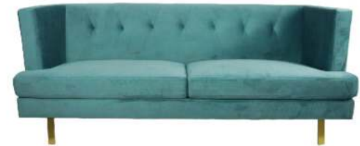
3 Seater Sofa Sap Code: 402-101-29 W207 x D86 x H84 cm Fabric, Velvet Blue, Leg, Golden 867 USD