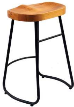
Bar Chair Sap Code:305-101-11 480x 390 x 750 mm(W*D*H) Wood Colour + Leg : Black