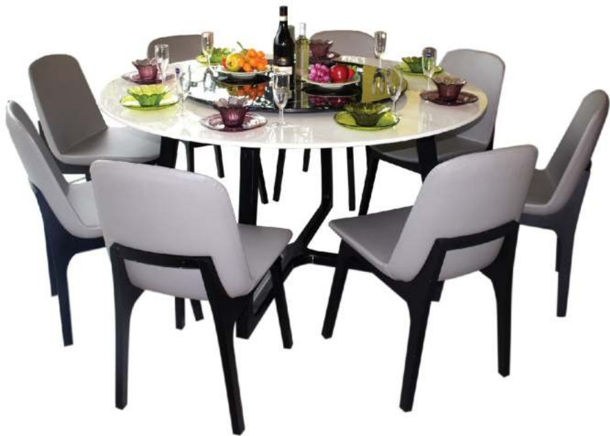
Dining Table Sap Code: 401-101-03 W1800 x H750 , Chair W450 x D55 x H82 Marble dining table,White marble 4,216 USD