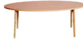
Coffee Table Sap Code: 402-201-08 W100 x D50 x H46.5 cm Density board + solid wood 93 USD