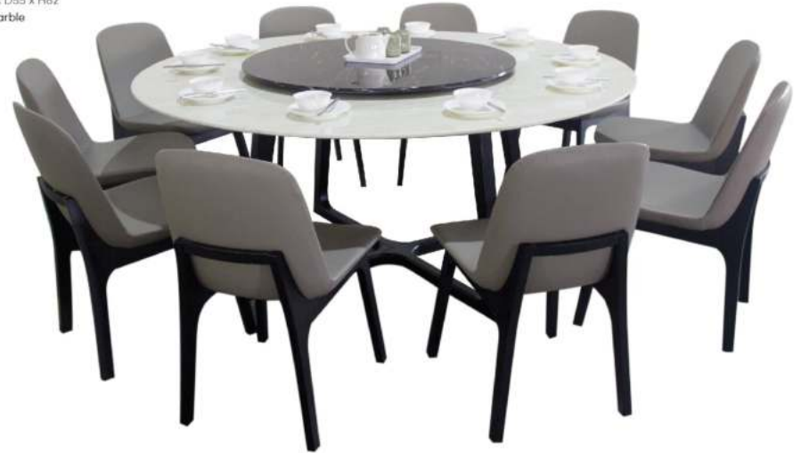
Dining Table Sap Code: 401-101-01 2,172 USD