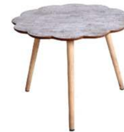
Coffee Table Sap Code: 402-201-06 W40 x D40 x H41.5 cm Density board + solid wood 81 USD