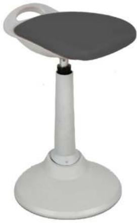
Bar Chair Sap Code:305-101-08 W40 x D41 x H65 cm Gray cloth seat. Automatic return to the gas pole. Gray plastic board