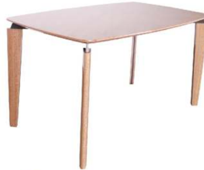
Dining Table Sap Code : 401-201-37 1400*850*755 mm (W*D*H) TOP:MDF+CERAMIC /METAL LEG 1,575 USD