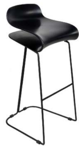
Bar Chair Sap Code:305-101-02 W40 x D45 x H90 cm Bar Chair,Plastic+Iron,Black Color