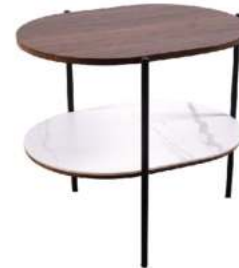
Coffee Table Sap Code: 402-201-68 W55 x D55 x H50 cm Venner+white sintered stone+steel frame 374 USD