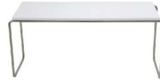
Coffee Table Sap Code: 402-201-03 W120 x D55 x H44 cm Density board + solid wood 116 USD