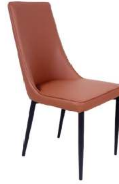
Dining Chair Sap Code: 401-301-27 W45 x D60 x H93 cm PU COVER / METAL LEGS 99 USD