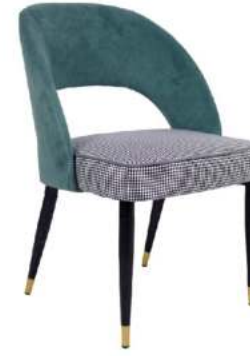
Dining Chair Sap Code: 401-301-26 W56 x D58 x H83 cm BACK-FABRIC / SEAT- FABRIC / IRON LEG 139 USD