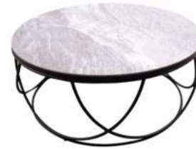
Coffee Table Sap Code: 402-201-62 W90 x H35 cm Sintered stone+steel frame 347 USD