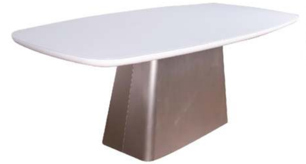
Dining Table Sap Code: 401-201-49 2200x980x760 mm (W*D*H) TOP: 5mm tempered crystal glass on face , MDF plate / LEG : stainless steel brushed matte nickel. 1,418 USD