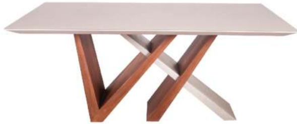
Dining Table Sap Code: 401-201-41 1800*1000*760 mm (W*D*H) TOP:MDF /METAL LEG 1,575 USD