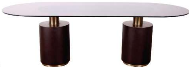
Dining Table Sap Code: 401-201-56 2400x1000x740 mm (W*D*H) TOP:GLASS+CERAMIC SHEET /STAINLESS STEEL LEG 1,575 USD