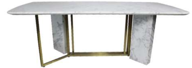
Dining Table Sap Code: 401-201-12 W220 x D100 x H75 cm 25mm MDF veneer lacquered top, base frame with stainless steel brushed in brass plating. 1,171 USD