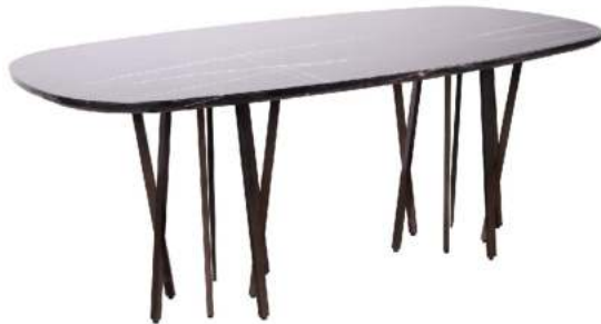
Dining Table Sap Code: 401-201-43 2200*1000*760 mm (W*D*H) TOP:MARBLE+MDF/ STAINLESS STEEL LEG 2,310 USD