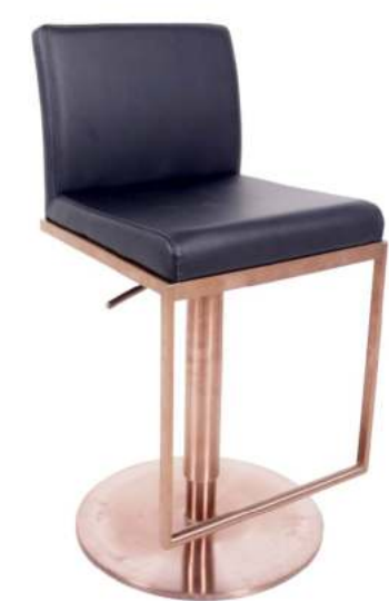
Bar Chair Sap Code: 305-201-07 W42 x D45x H80-105cm PU imitation leather, iron spray paint, can be turned up and down,Black