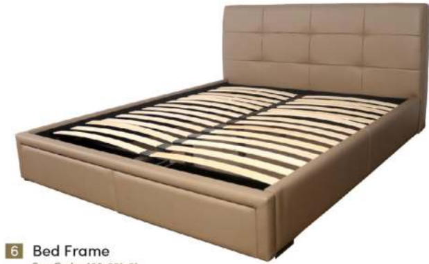
6 Bed Frame Sap Code: 403-201-01 167.5*217.5*97 cm MATTRESS SIZE:165*195cm 465 USD