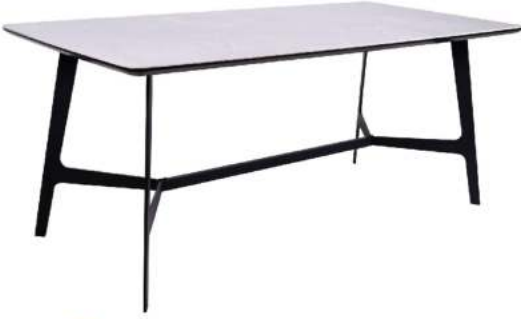
Dining Table Sap Code: 401-201-24 1795 x 895 x 750 mm (W*D*H) TOP-GREY / BASE-SANDY BLACK 867 USD