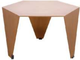
Coffee Table Sap Code: 402-201-87 580*500*350 mm (W*D*H) All Stainless Steel 735 USD